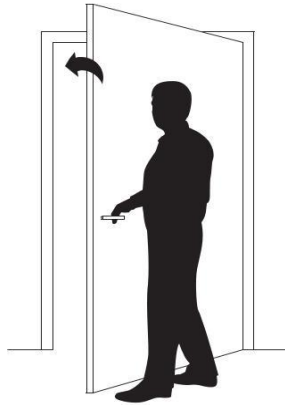
RIGHT HAND LEADING close in a clockwise direction