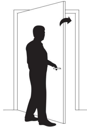
LEFT HAND LEADING close in counter clockwise direction